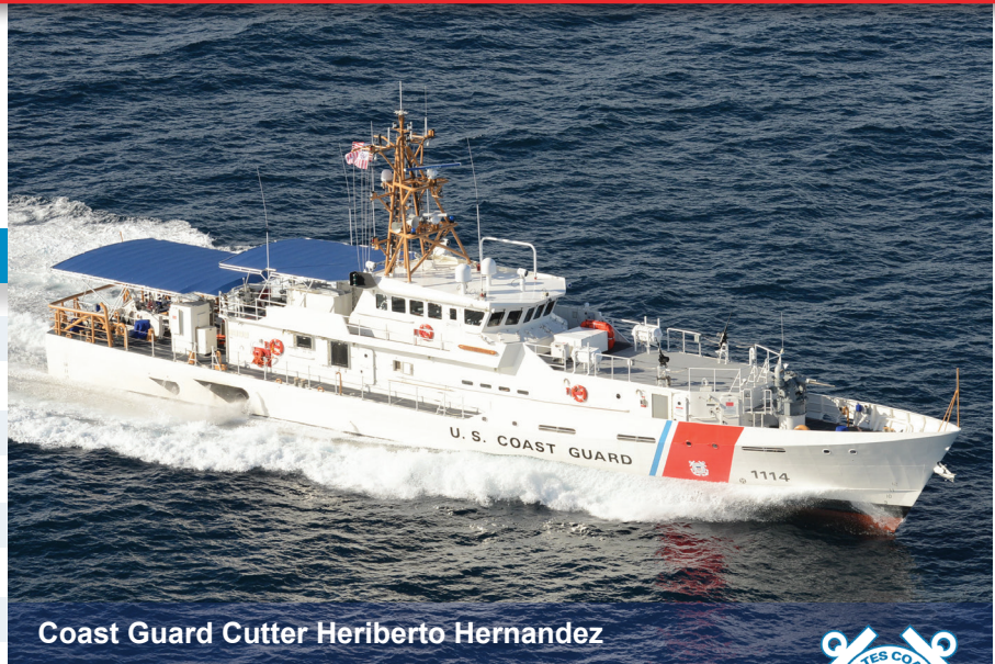
Coast Guard Cutter Heriberto Hernandez